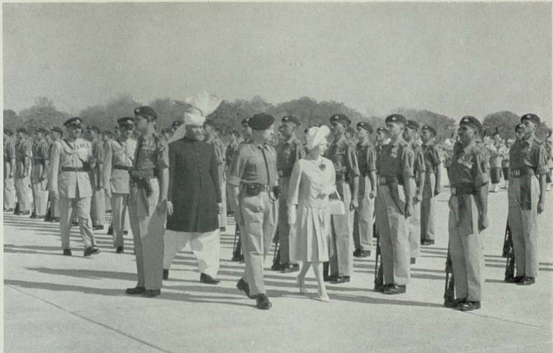
H.M. THE QUEEN INSPECTING THE GUARD OF HONOUR OF THE GUIDES INFANTRY AT LAHORE, ON 14th FEBRUARY 1961, DURING HER TOUR OF PAKISTAN