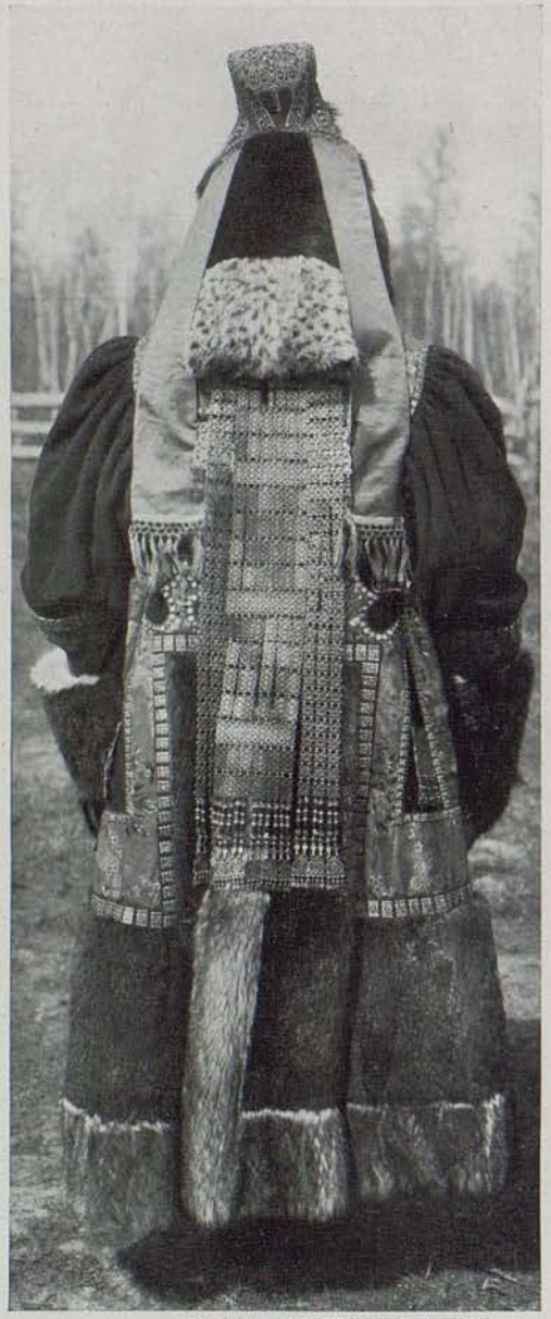
A BACK VIEW OF A RICH YAKUT GIRL'S COSTUME, SHOWING WIDE BAND OF FINE SILVER-WORK : SIBERIA

when the Zemstvos—local self-government—were introduced.