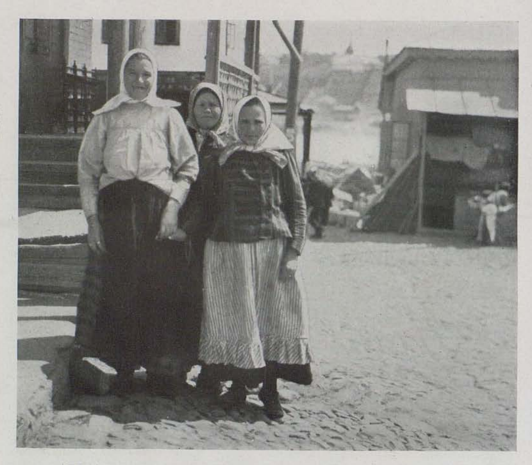
THREE YOUNG LADIES OF NIZHNI NOVGOROD PHOTOGRAPHED BY THEIR OWN REQUEST

greedy wolves, the cruel bears, and every ill beast."