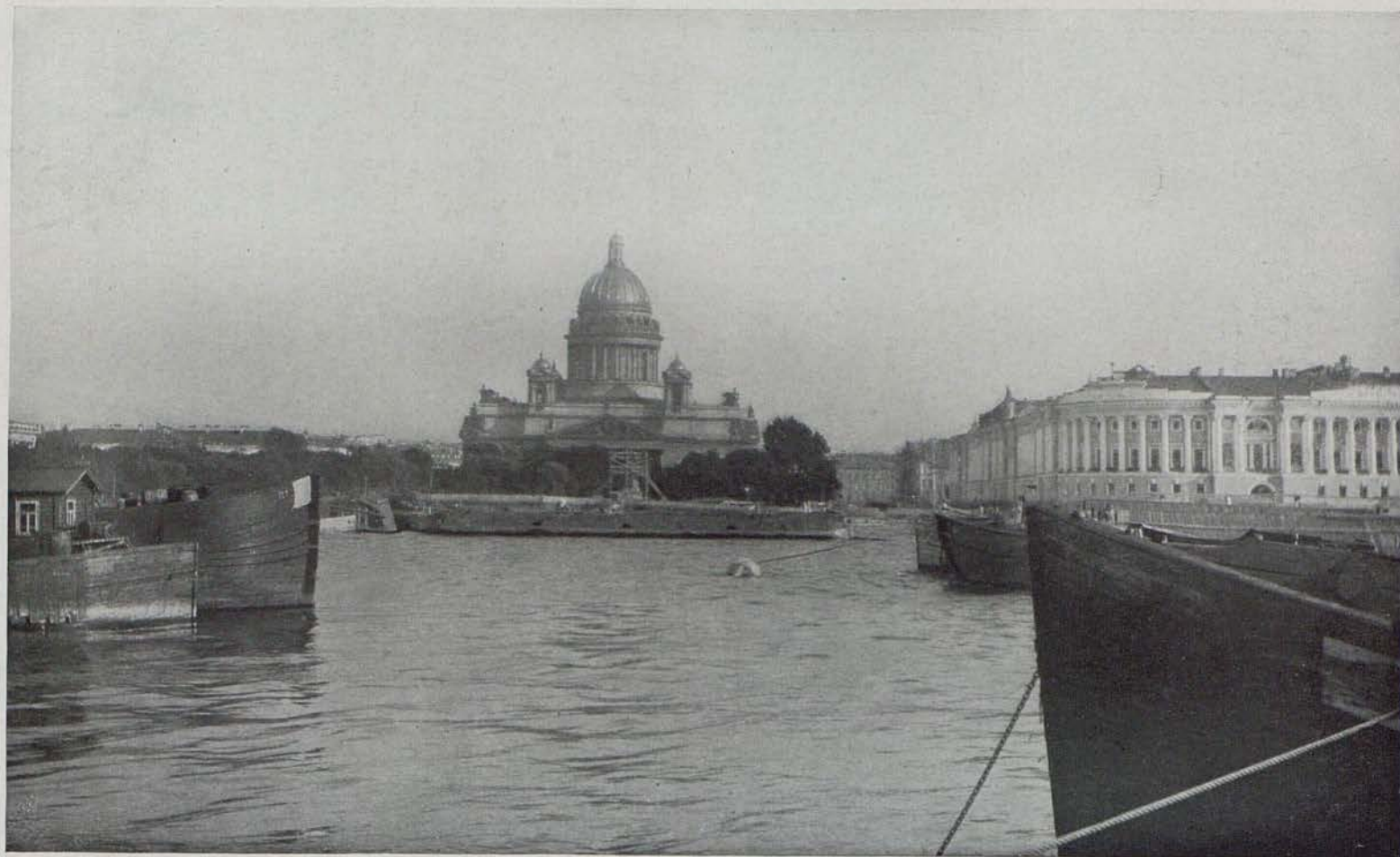
THE CATHEDRAL OF ST. ISAAC: PETROGRAD