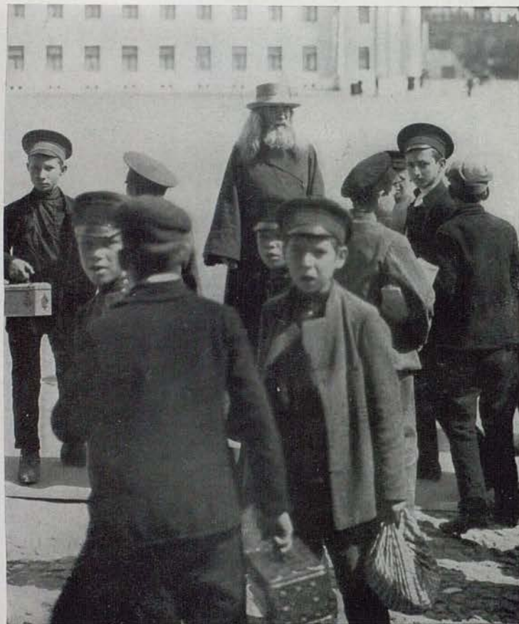
SCHOOLMASTER AND BOYS: MOSCOW, RUSSIA

The percentage of illiteracy in Russia is higher than in any other civilized country. According to the most recent estimates (1908), only 211 persons out of every 1,000 can read and write. But these conditions are being remedied rapidly, for a census taken during the last decade of the nineteenth century showed that at that time only 50 out of every 1,000 could read and write. Illiteracy among the women of Russia is far greater than among the men, the proportion being more than two to one.