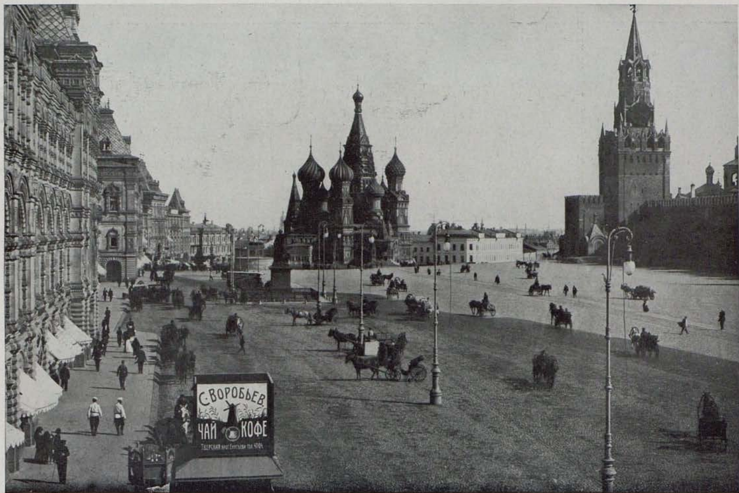
THE RED SQUARE: MOSCOW

Lying between the Kremlin and the Inner City, this great space in the heart of Moscow has an area of more than thirty acres. To the right is seen a part of the battlemented wall of the Kremlin. In the center of the picture is the unforgettable Cathedral of St. Basil. To the left may be seen a portion of the front façade of the famous Trading Rows, erected at a cost of nearly $8,000,000 (including the site), for wholesale and retail shops and offices. The Historical Museum and the Kazan Cathedral bound the square on the fourth (north) side.