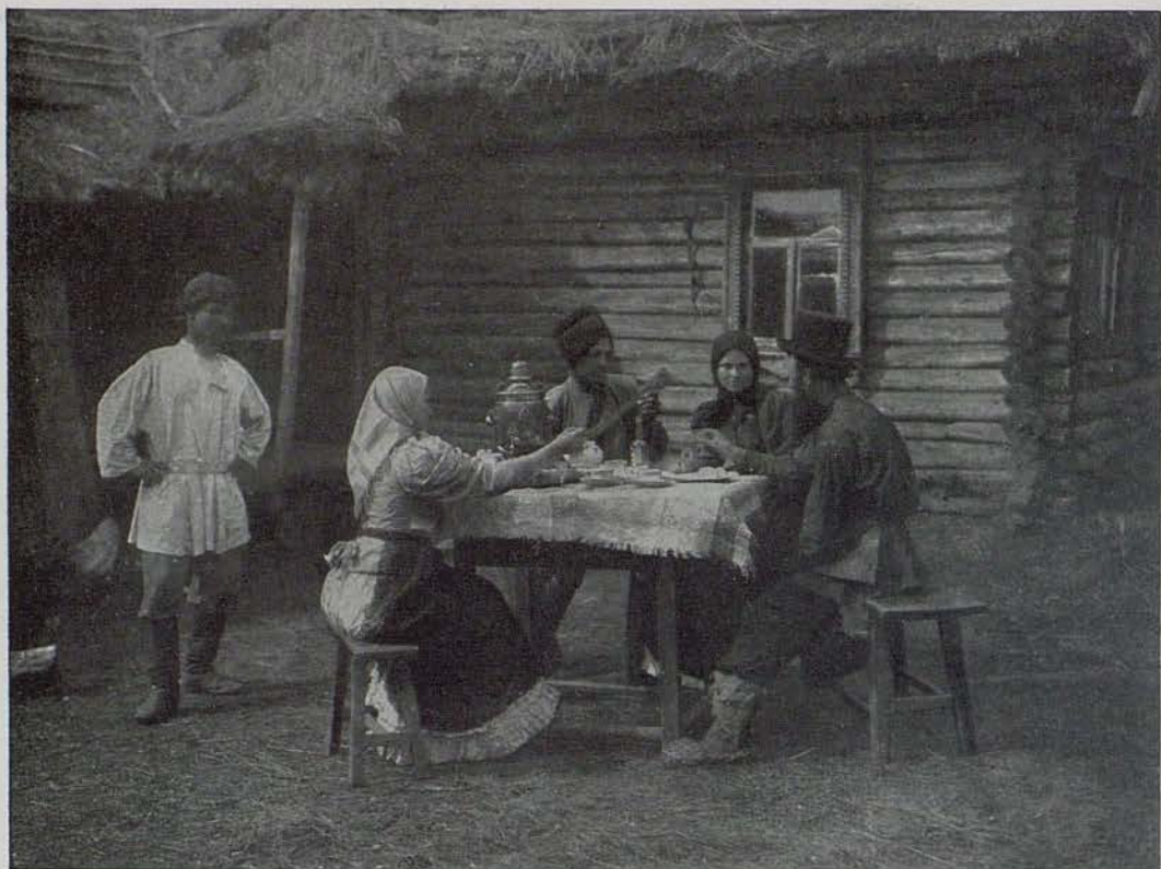
AFTERNOON TEA IN RUSSIA

The popularity of the cup which cheers but does not inebriate has increased enormously since vodka went out of fashion. Another favorite table beverage of the Russians is kvass, the liquor drawn off soaked black bread or white bread.