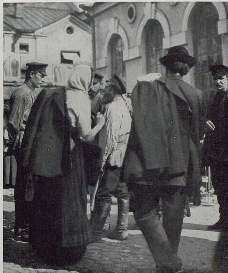
OF SUCH IS THE EMPIRE OF RUSSIA

The percentage of illiteracy in Russia is higher than in any other civilized country. According to the most recent estimates (1908), only 211 persons out of every 1,000 can read and write. But these conditions are being remedied rapidly, for a census taken during the last decade of the nineteenth century showed that at that time only 50 out of every 1,000 could read and write. Illiteracy among the women of Russia is far greater than among the men, the proportion being more than two to one.