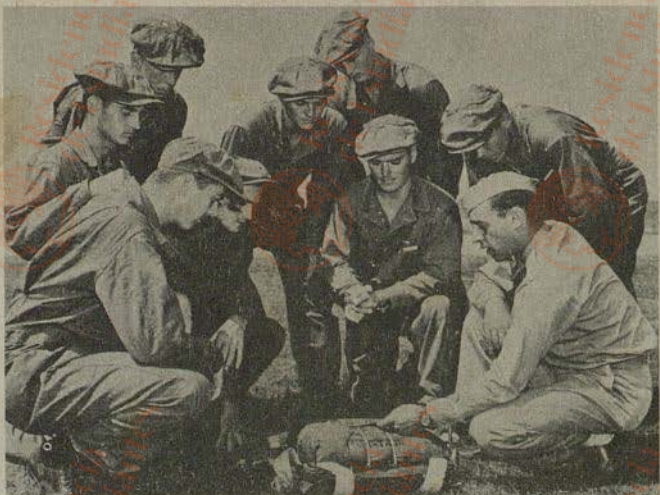
Flying Cadets Study Construction and Functioning of Parachutes

the enclosed franked and addressed postcard; it requires no postage. A pamphlet will be promptly mailed to you; in it you will find the answer to practically any question you may desire to ask concerning the requirements for enrollment in Army flying schools, the courses of study to be pursued while there, and the possibilities of obtaining active training as a pilot with the Regular Army following graduation.