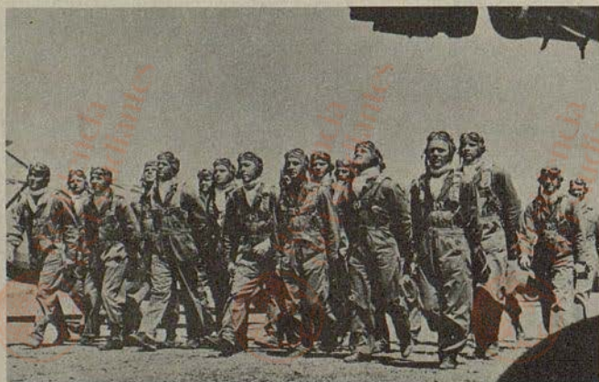
Flying Cadets on Way to Planes for the Thrill of First Solo Flight

Should you desire more complete information with respect to these opportunities, sign and return