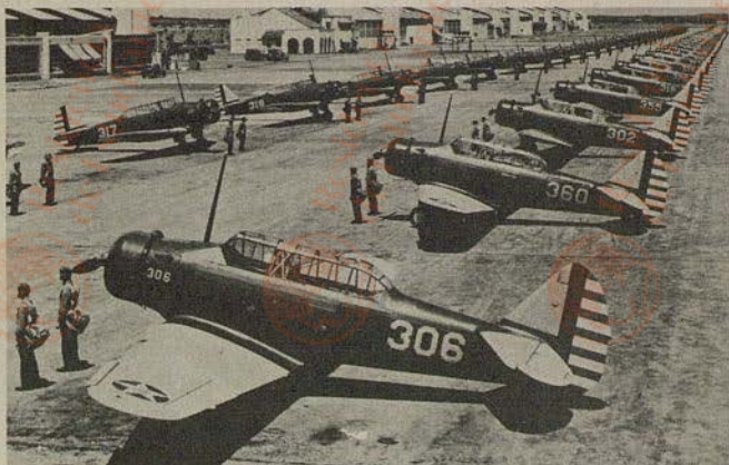
Training Ships at Randolph Field, Texas

numbers, not only for continuous duty with the Regular Army, but in the Air Corps Reserve, ready to answer a call to the colors in time of emergency. In order that it may have a sufficient number of pilots always available, the War Department has established its own flying schools at Randolph and Kelly Fields, Texas, and also cooperates with numerous civilian flying schools in training personnel for military aviation.