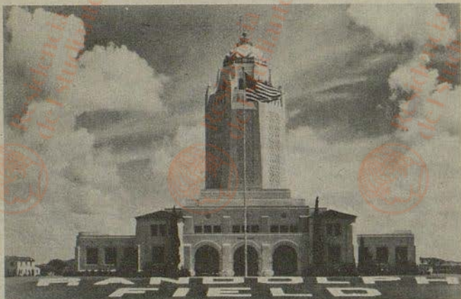
The Administration Building, Randolph Field, Texas, Home of West Point of the Air

I F YOU have already decided definitely upon a career in the law, medicine, architecture, civil engineering, or any one of a number of professions calculated to keep you on the ground, the message contained in this little folder is not for you.