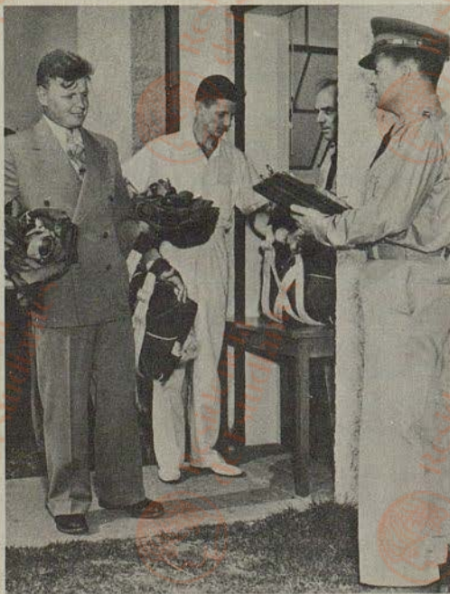
Newly Enrolled Cadet Drawing Flying Togs

Military aviators, of course, are essential in our scheme of national defense. They are needed in large