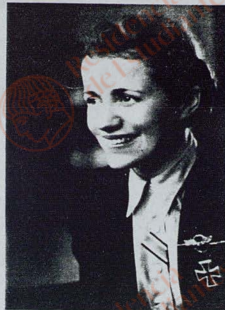
Signed photograph of Hanna Reitsch.