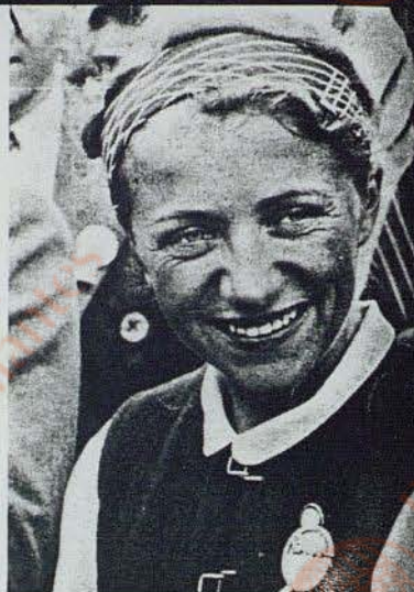
Hanna Reitsch during a war-time civil aviation competition.

her life she admitted that the political events in Nazi Germany had left her shaken and disgusted. Hanna Reitsch died at Frankfurt am Main on August 24, 1979.