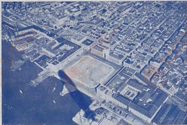
Bird's-eye View of Lisbon

If you wish to realize the speed, comfort, safety, reliability and economy of modern air transportation, there is no better way than to travel by Zeppelin.