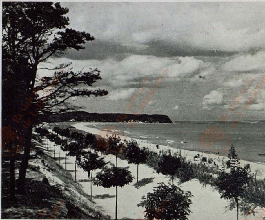
GÖHREN—ISLE OF RÜGEN