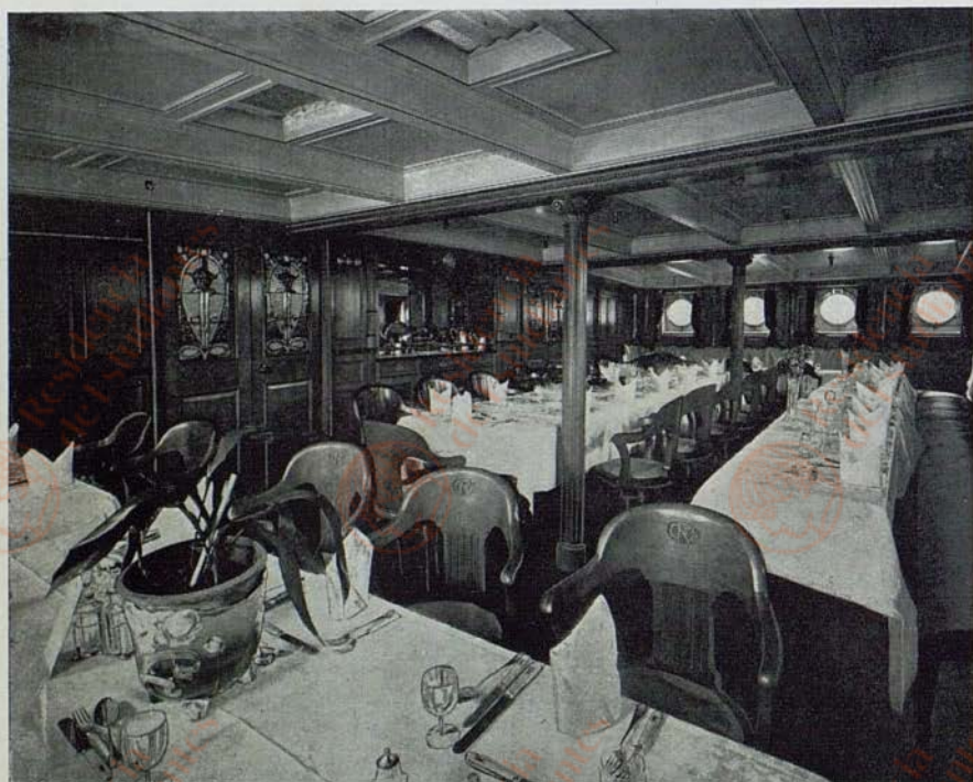
DINING SALOON ON BOARD