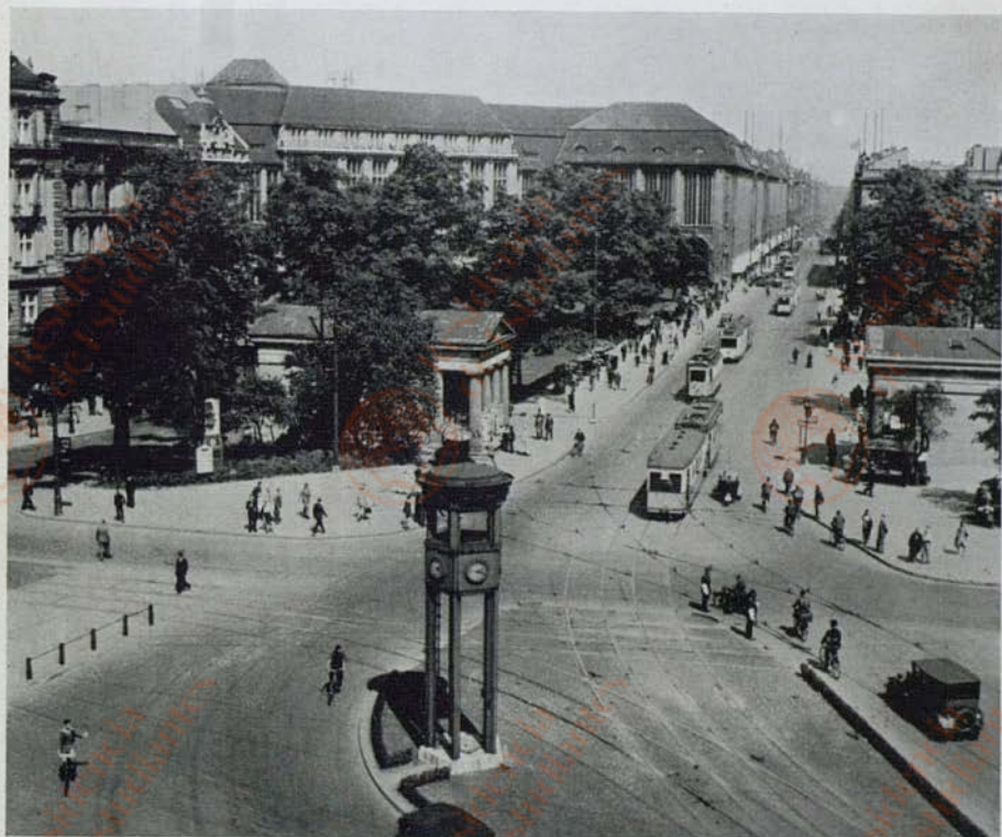
POTSDAMER PLATZ, BERLIN