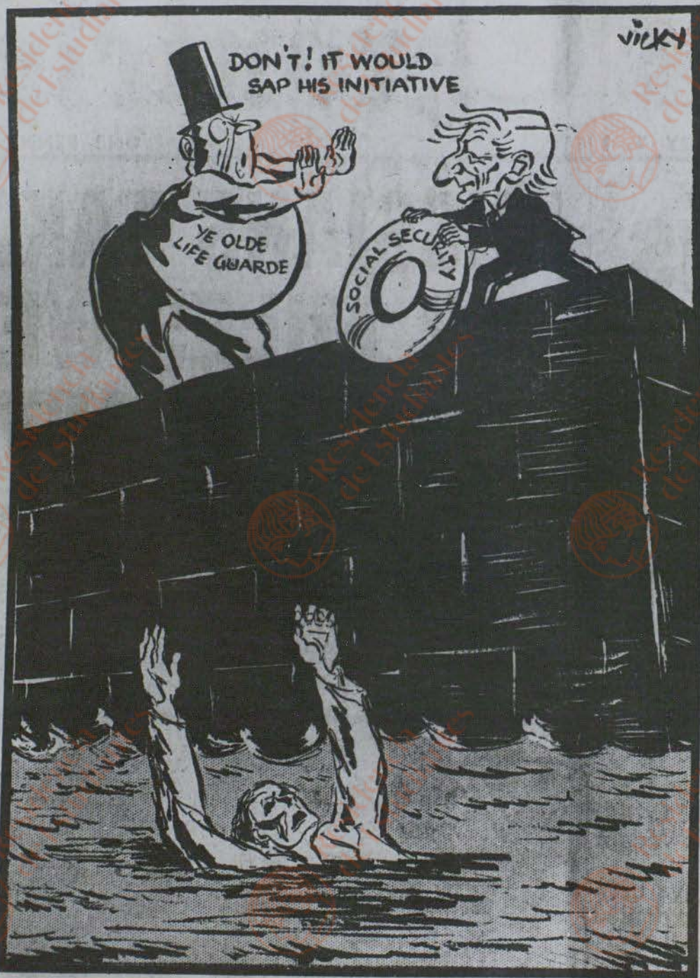
THERE'S NOTHING LIKE ADVENTURE

would riable ustry the thing ficial agri- emy. se as last at all and ason ning