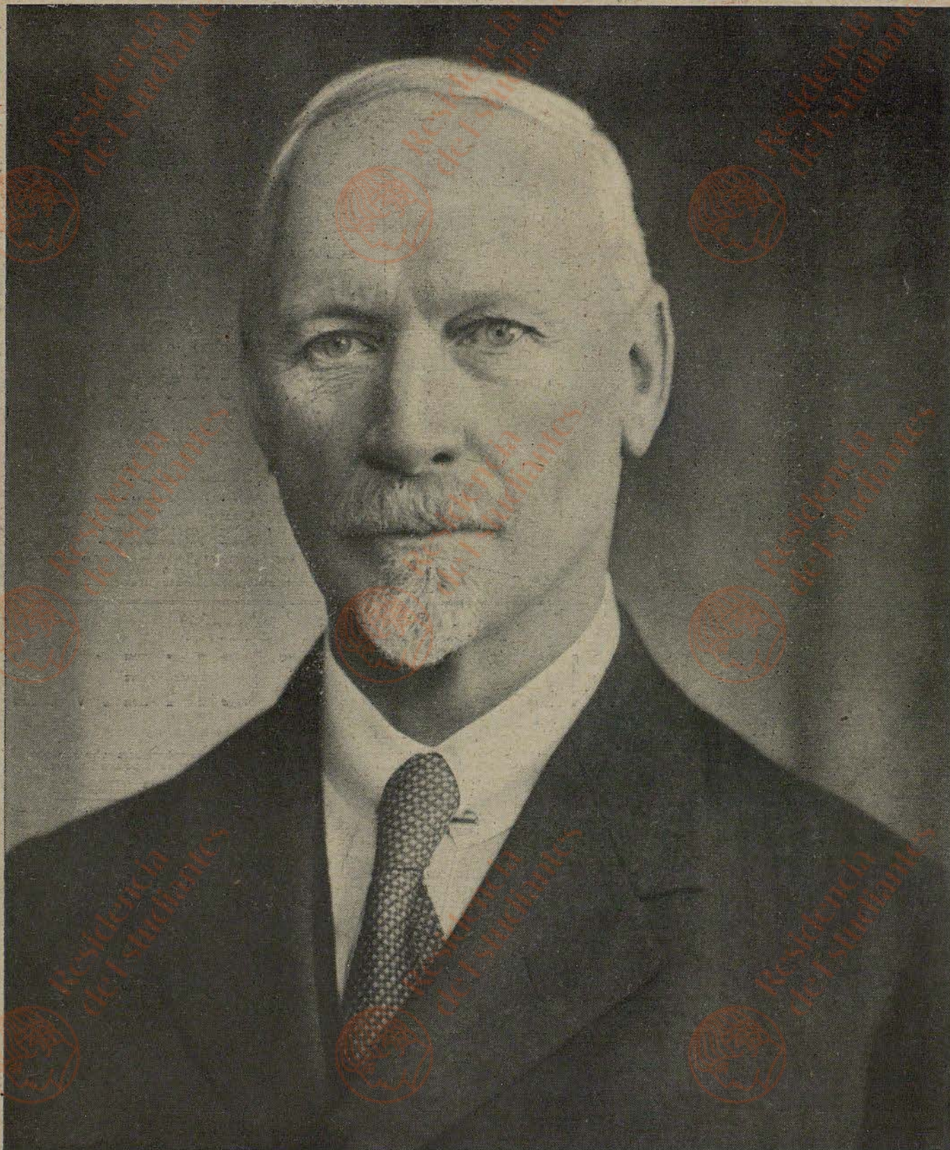
Jan Christiaan Smuts

A gallant foe during the Boer War, there has since been no more loyal son of the British Commonwealth than General Smuts. He was Prime Minister of South Africa from 1919 to 1924, and a few days after war began in 1939 was again called to that office to lead South Africa's war effort.