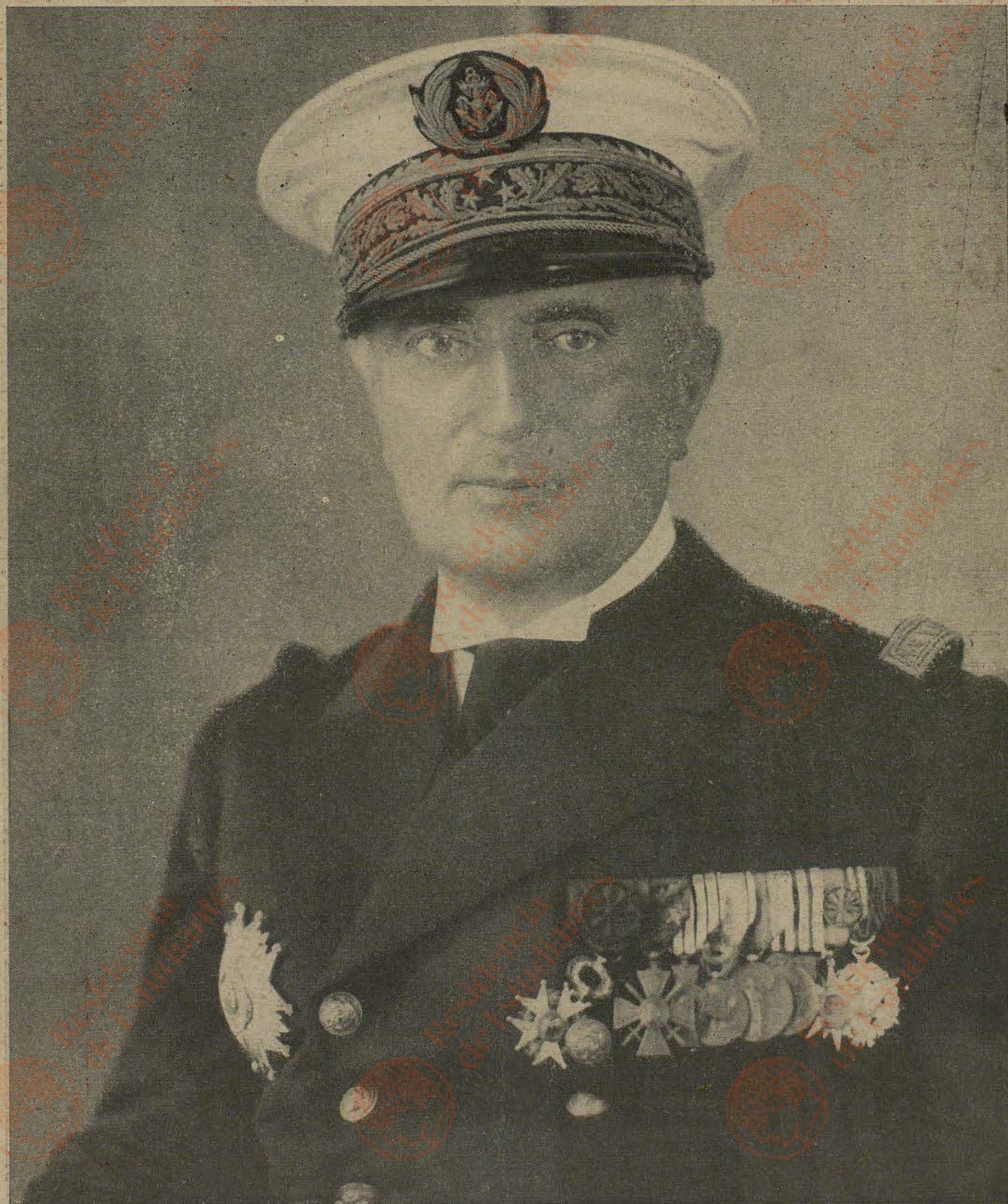
Jean François Darlan

During the last war Admiral Darlan, who entered the French Navy in 1899, was thrice mentioned in dispatches. In 1936 he became Vice-Admiral, then the highest rank in the French Navy, but by a decree of June 6, 1939, he became Admiral of the Fleet, a rank which had not been given in France since 1870.