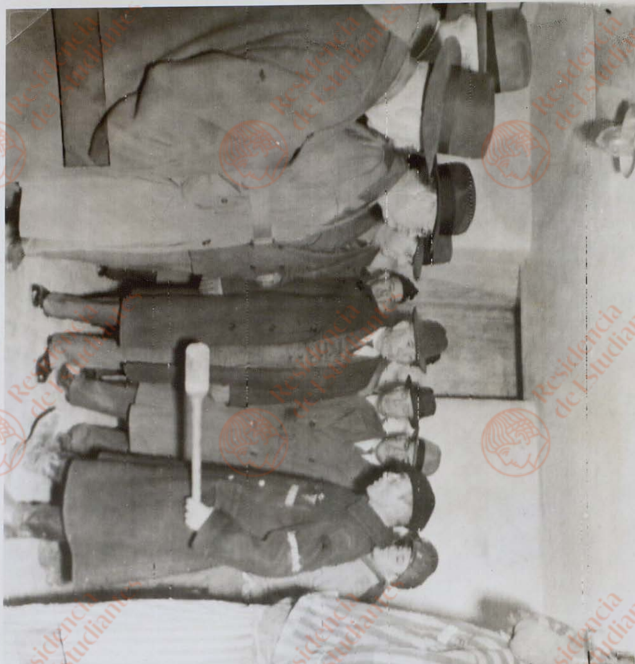
(GERMANY) 26/4/45--U S LEGISLATORS IN GERMANY TO WITNESS NAZI CONCENTRATION CAMP HORRORS AT BUCHANWALD. HEAR FORMER PRISONER DEMONSTRATE HOW VICTIMS WERE HUNG ON HOOKS AND THEN CLUBBED TO DEATH. L TO R; REP EWING THOMASON, TEN, REP JAMES W MOTT, OREGON; SEN BROOKS, ILL; SEN WHERRY, NEB, SEN BARKLEY, KY; REP SHORT, MO; AND REP VORYS, OHIO.