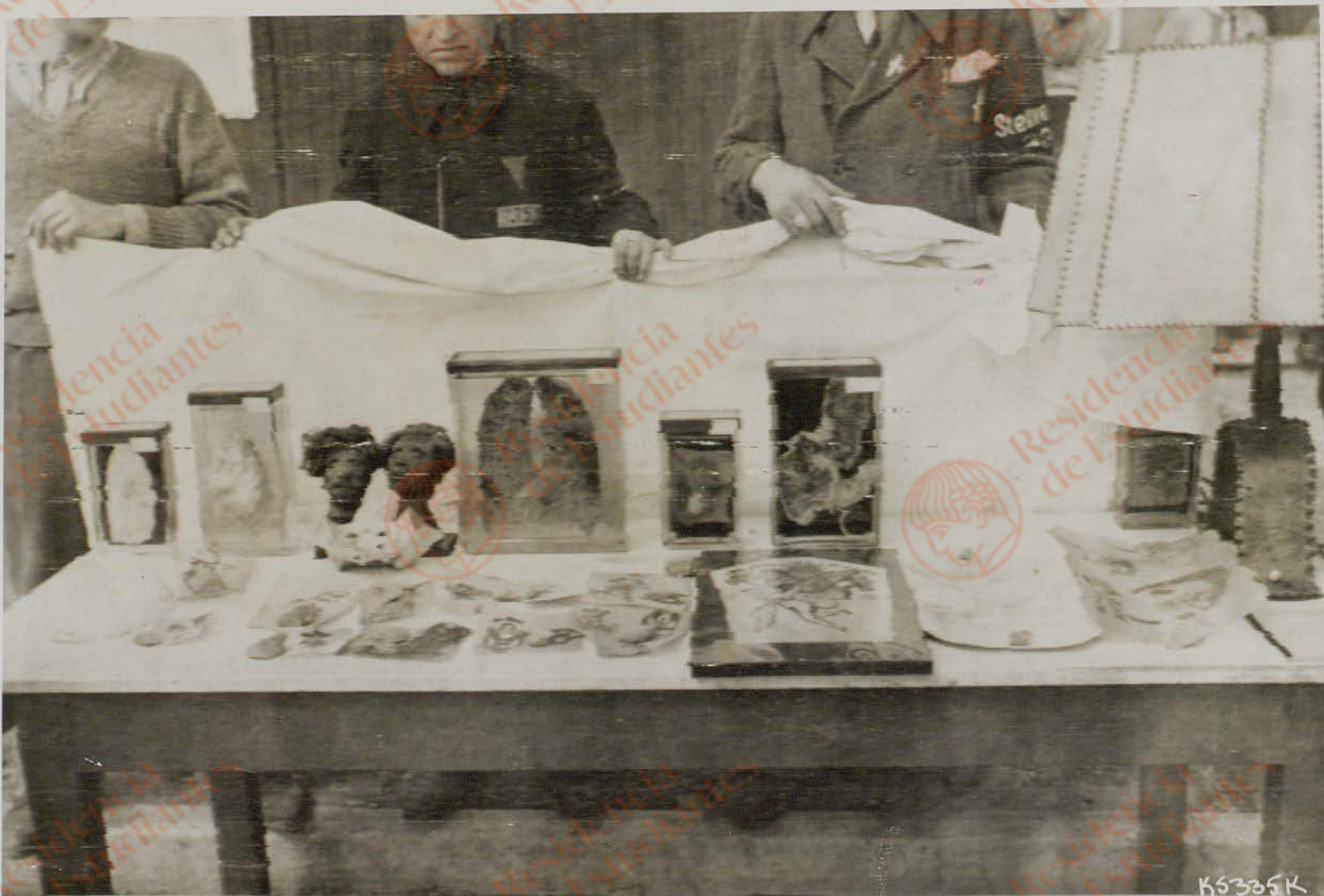
K5325K (GERMANY) 19/4/45--HORROR CAMP AT BUCHENWALD, NEAR WEIMAR, SEIZED BY GEN. PATTON'S THIRD ARMY. GERMAN CIVILIANS ARE BROUGHT FROM TOWN TO GAZE UPON SHRUNKEN HUMAN HEADS, LEFT, PARTS OF ORGANS OF VICTIMS WHO DIED OF VARIOUS DISEASES, AND STENCILLINGS AND TATOO MARKINGS ON SECTIONS OF HUMAN SKIN. LAMP AT RIGHT WAS FABRICATED FROM SKIN OF DEAD. (SIG C FOTO 16/4/45) SIGNAL CORPS RADIO TELEPHOTO FROM LONDON. #4811