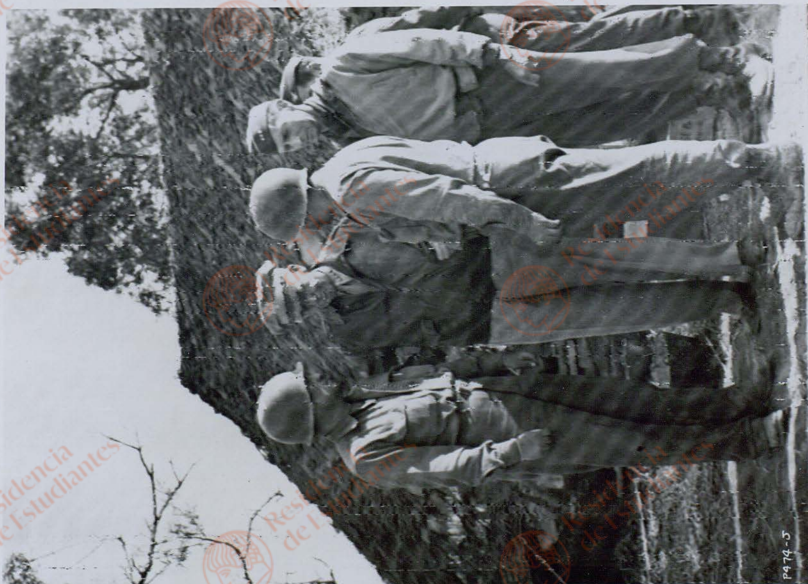
19 JUNE 1944 (ITALY) GEN. MARSHALL VISITS ITALIAN FRONT: GEN. GEORGE C. MARSHALL, CHIEF OF STAFF, U.S. ARMY CHATS WITH MESS SERGEANT AND AN INFANTRY OFFICER DURING HIS FIRST VISIT TO THE ITALIAN FRONT, ON THE RIGHT, IS LT. GEN. MARK W. CLARK, COMMANDING GENERAL, FIFTH ARMY.